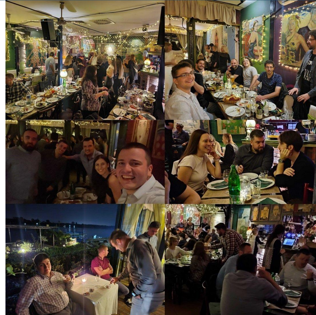
These pictures were taken at our recent social event at Restoran Reka We wrote about it on LinkedIn